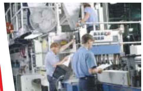
Neutralisation of harmonics of speed drives, DC motors, etc.