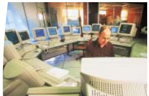
Neutralisation of harmonics of server power supplies, PCs, hard disk drive motors, etc.

Total management of harmonics and \cos \phi for installations up to 1000 kVA