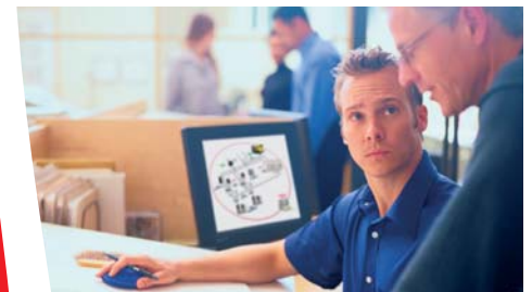
Servers, networked PCs, peripheral devices, workstations.