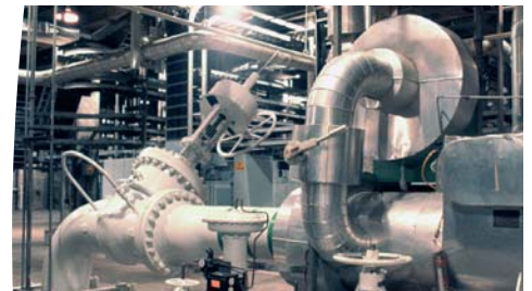
Oil refineries, offshore oil platforms, control rooms, circulating pumps for fluids, radio systems.