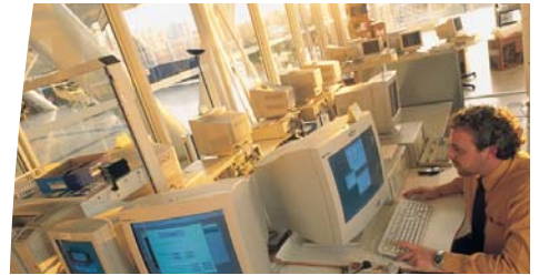
The power level can be upgraded simply and without interruption for the existing loads as the number of loads supplied is increased.