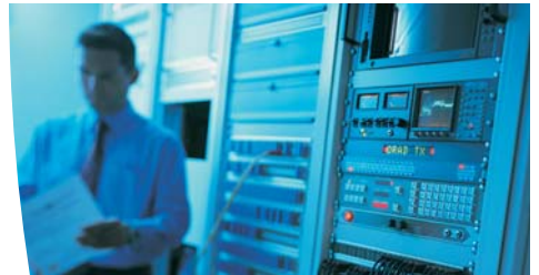
Can be built in to high density racks.