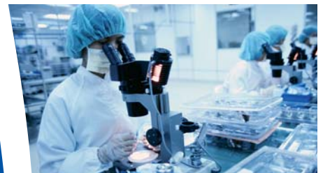
Redundancy for highly critical applications.