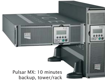
Pulsar MX: 10 minutes backup, tower/rack mounting (3U), mimic, LCD display.