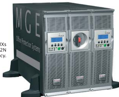
Paralleling 2 Pulsar MXs using ModularEasy for 2N or N+1 redundancy.

Can be used for 20 to 110 servers, ideal for: